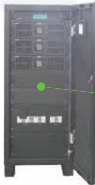
3 U Battery Box Optional