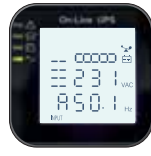
Module Control Panel