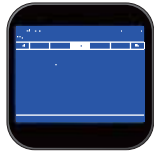
UPS Cabinet Control Panel